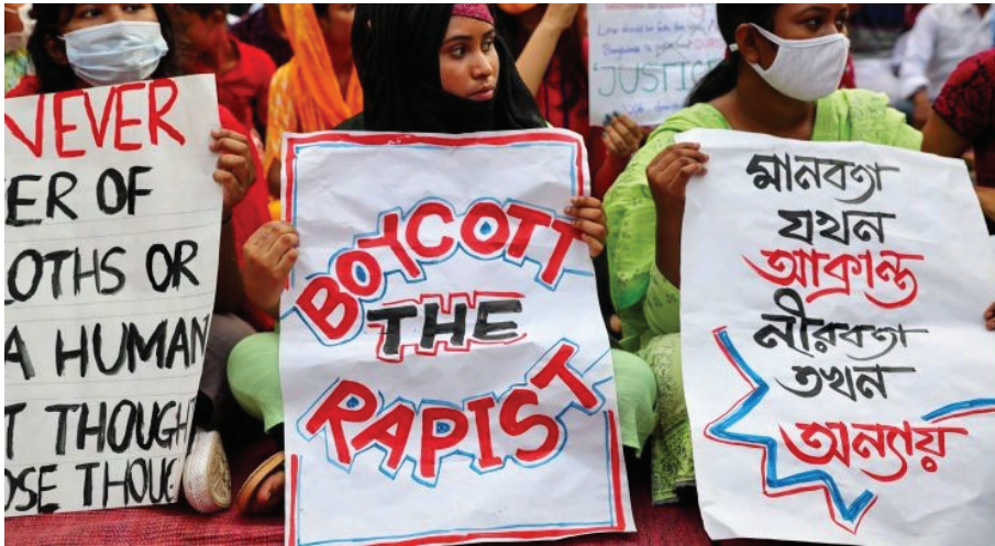
Last year death penalty approved for rapists in Bangladesh